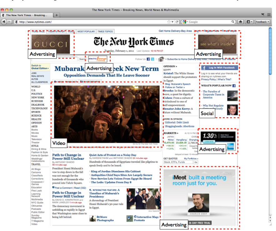
Figure 1. Third-party advertising, social, and video content on the New York Times website. Analytics content is not visible.

Web measurement provides objective, reliable evidence that both furthers public understanding and establishes a sound basis for policymaking.