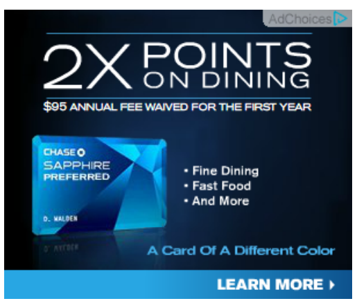
(b) Implemented icon and text [105] (actual size at 115 DPI).

icon's] communication effectiveness over time"), and that the text "AdChoice" performed worse than alternatives.